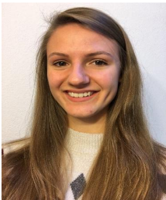
Our New K-3 Teacher